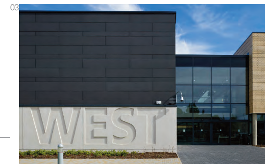
01 Internal courtyard 02 Triple-height circulation void 03 Main entrance