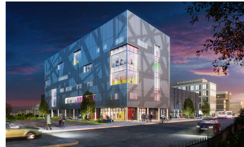
[Below] Development strategy diagram [Above] New sports building currently under construction

A cohesive and sequential programme of improvements to the external realm will not only improve links and routes across the campus and improve the servicing and management of the estate, but also improve the impression and atmosphere of the campus at large.